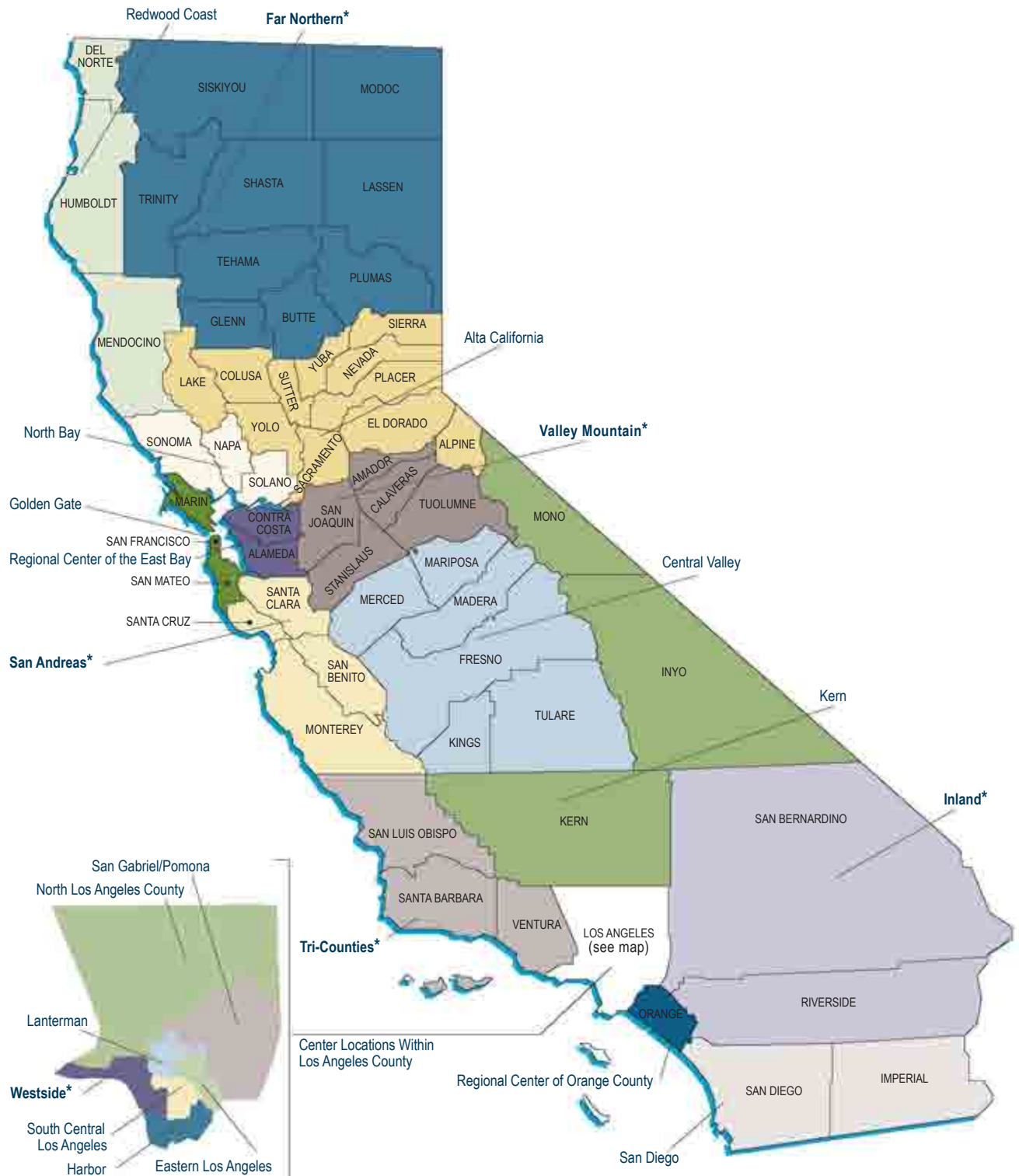
Figure A Map of Regional Center Service Areas